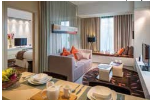
1 Bedroom Suite (40sqm)